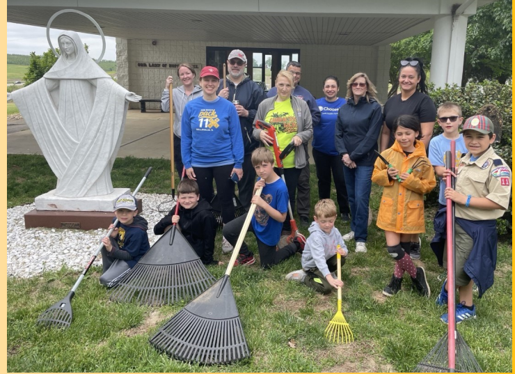
Cathedral Cub Scout Pack 11, parents, and parishioners who helped in the Annual Beautification of our Green Mount Catholic Cemetery