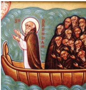
St. Brendan the Navigator