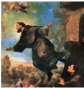
St. Joseph of Cupertino