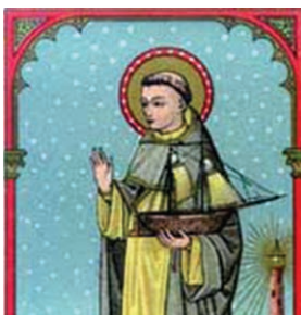
St. Adjutor of Vernon

No matter what kinds of activities we choose to enjoy during the summertime, let us remember to honor the saints who have gone before us and give their intercession for us as we walk through our own journeys of faith.